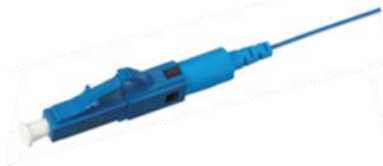
*A : LC-SF-SM-09